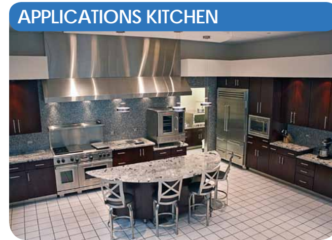
Designed for testing our flavors and colors in your applications for optimal product performance